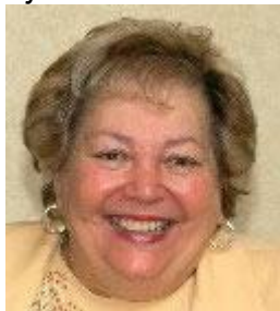
Syosset, New York