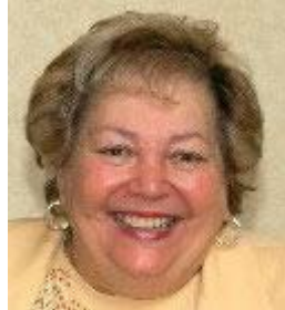
Syosset, New York

Jews love their dogs. This is the age of the B-A-R-K Mitzvah! The late Joan Rivers celebrated her dog, Spike’s Bark Mitzvah on her daytime television show. Spike wore a tallit and a kippah for the show.